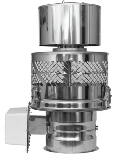
GFD Damper with RSD Fan