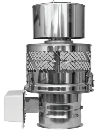
GFD Damper with RSD Fan